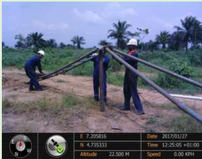
Percussion Rig for Borehole Drilling

Giolee Global Resources Limited conducted a Tier 2 Assessment along 28" Nkpoku-Bomu Trunkline in Norkpo, Tai Local Government Area of Rivers State for Shell Petroleum Development Company (SPDC) Nigeria Limited. The assessment was to verifying the presence and extent of hydrocarbon contamination in groundwater and soil. Drilling and installation of boreholes were carried out to determine the groundwater elevation, configuration, as well as direction of groundwater flow. Soil and groundwater samples were collected for laboratory analysis and reporting.