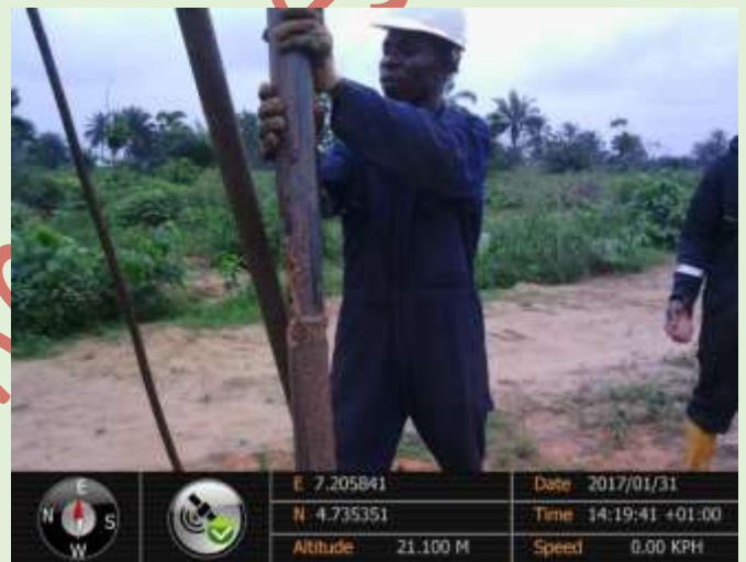
Shelling activity showing Oily condition of Soil