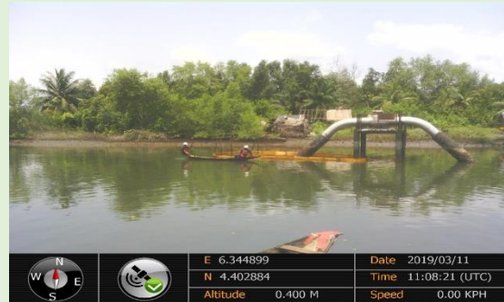
Plate 12: Monitoring activities during low tide with hand pulling canoe.