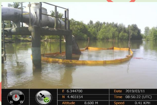
Plate 9: Clean surface undergoing monitoring