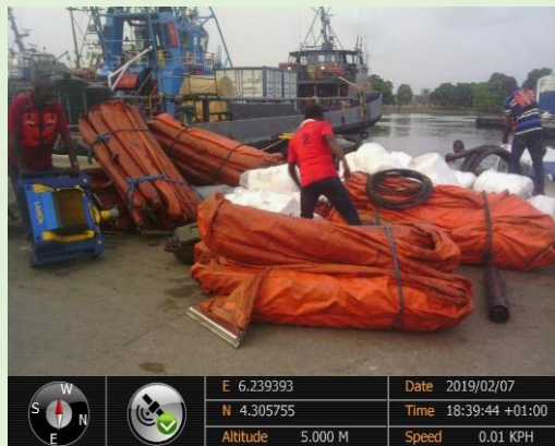
Plate 1: Offloading of Equipment at N.A.O.C Terminal Brass

The 24" Ogoda pipeline is located in Nembe, Brass local Government area of Bayelsa state. The site is on the right of way in creek area of Fantuo where the Riser is located, and the creek connects the Fantuo and Nembe water ways.