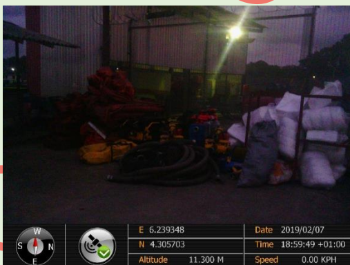
Plate 3: Mobilized Equipment for the operation