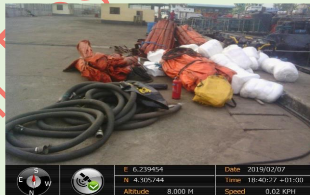
Plate 2: Offloading of materials