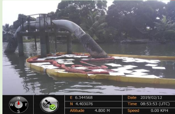
Plate 6: Mopping in progress still on monitoring