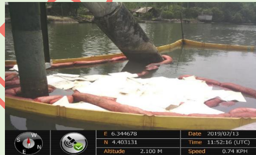
Plate 8: Monitoring continue