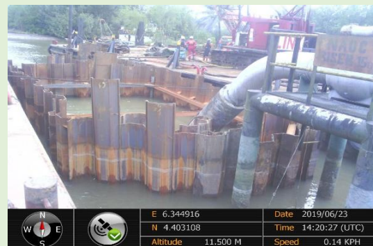
Plate 16: Mudding of the cofferdam door by maintenance team