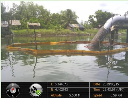
Plate 13: Free Surface clean water after recovery