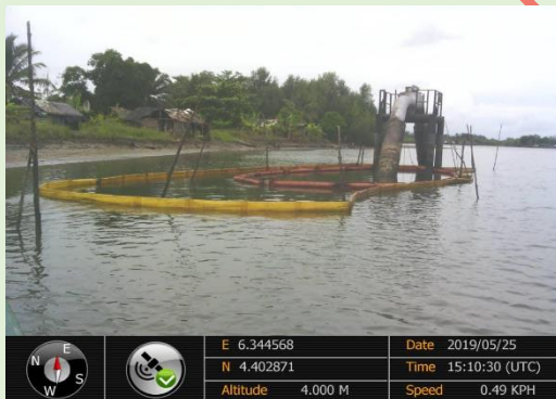
Plate 15: Clean surface around the riser