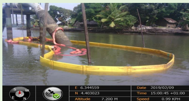
Plate 4: Overview of spill point