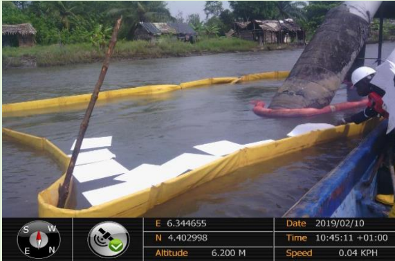
Plate 5: Mopping of residual oil with absorbent pad