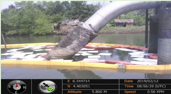
Plate 7: Mopping with absorbent pad ongoing