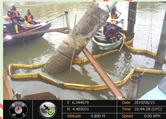
Plate 14: Clean surface