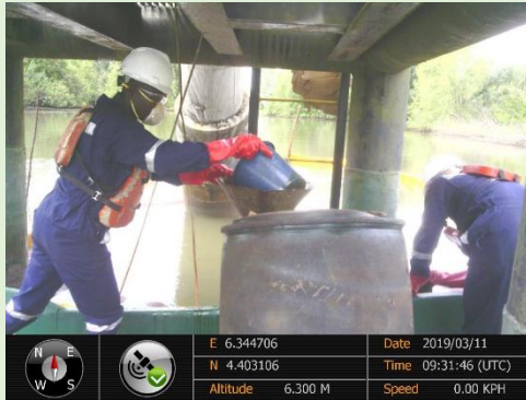
Plate 11: Manual Recovery ongoing at spill point