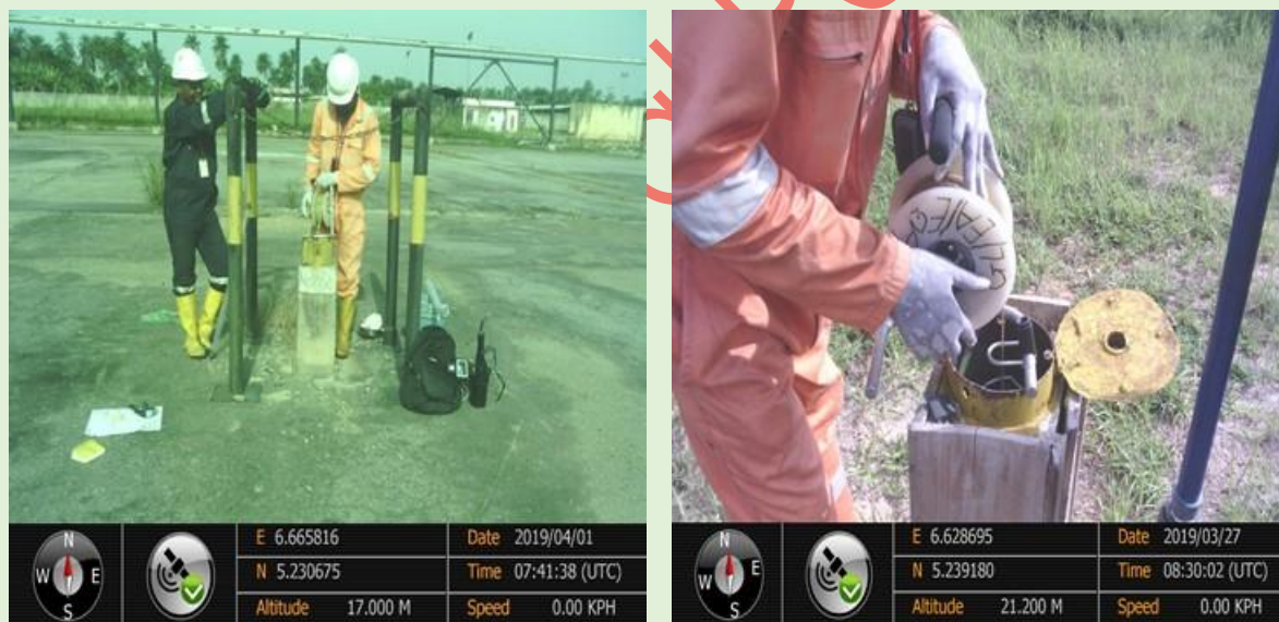
Plate 1: Borehole Measurements

The groundwater assessment of NTRP/OB90, Ogbogu Flow station, the Obite area and the Utility boreholes have been completed in line with the approved work scope and statutory requirement for environmental management in Nigeria.