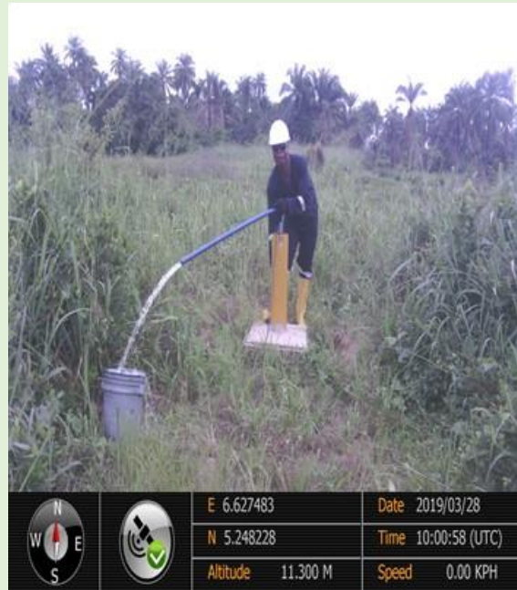
Plate 2: Flushing of Boreholes