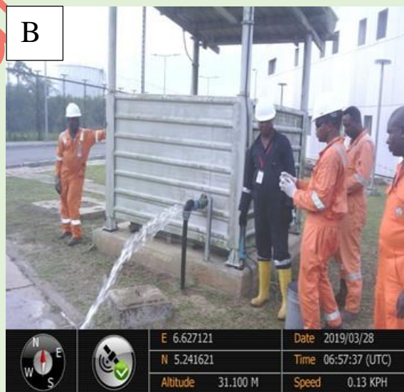
Plate 4: A= A running Utility Borehole before collection. B= In-Situ Measurements using Horiba